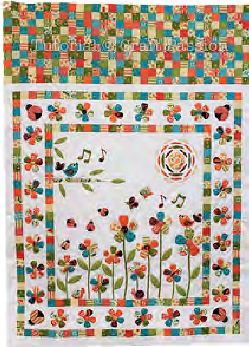
Full assembly of the front quilt after sewing all the pieces together.