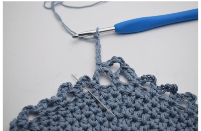
12. In the next ch loop. (Where the needle is pointing)