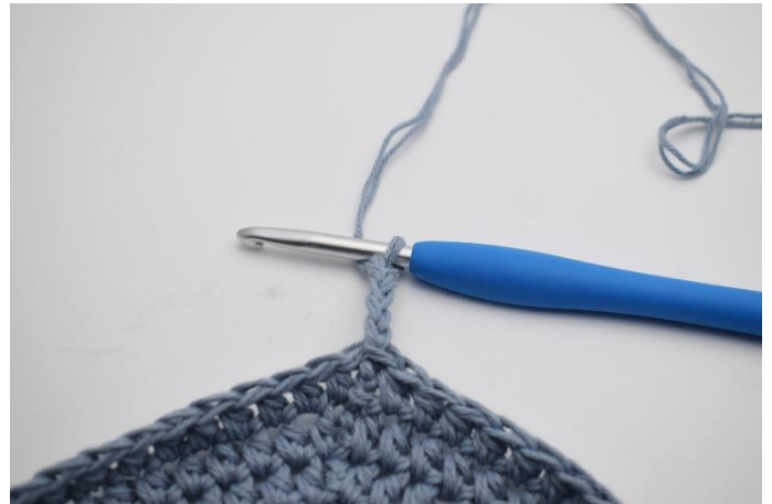
2. Ch 5.