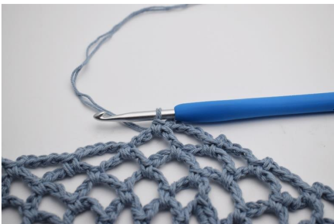
17. This is the end of the 4th rnd with color 1.