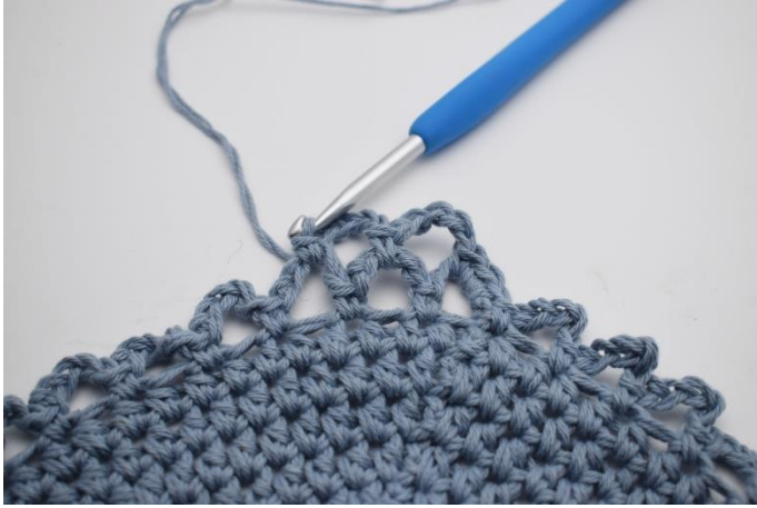
13. Work 1 sc.