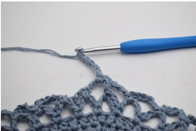
15. Now you are ready for the next rnd. Ch 5.