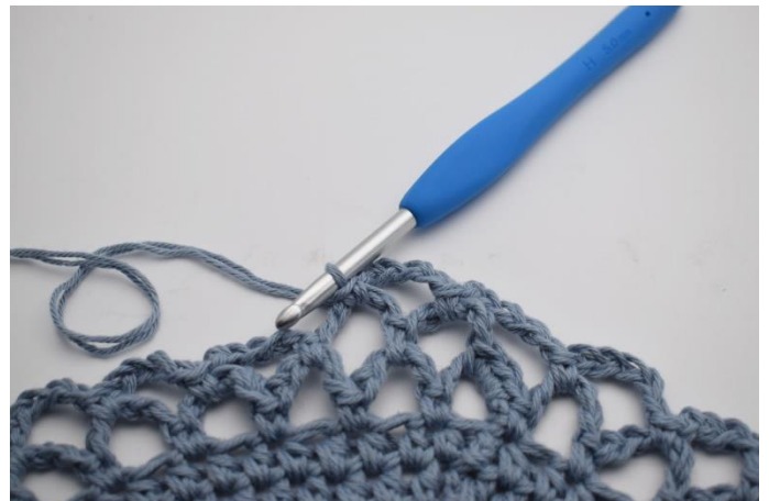
16. Work 1 sc into the next ch-loop. Repeat to the end of the rnd and continue until you have a total of 4 rnds with Color 1.