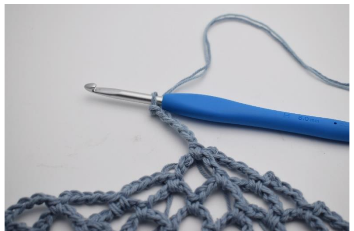
18. Change 1 strand to Color 2, so you are now working with 1 strand of color 1 and one strand of color 2. Ch 5 with the new color.