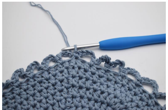
6. Repeat to the end of the rnd, so now you have 36 ch- loops around your base.