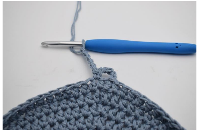
4. Ch 5.