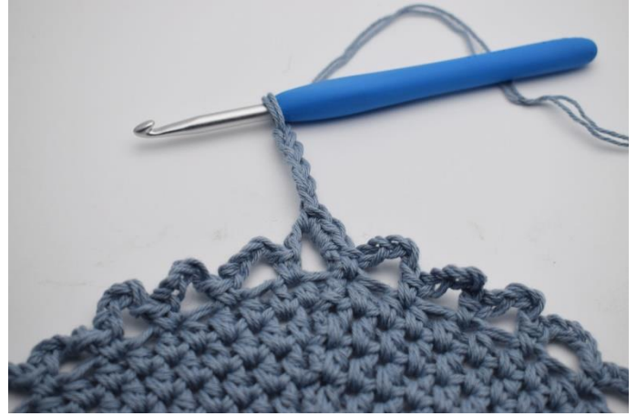
8. Ch 5.