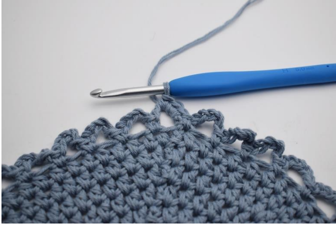
7. Work 3 sl st along the first ch-loop, so you are starting in the middle of it.