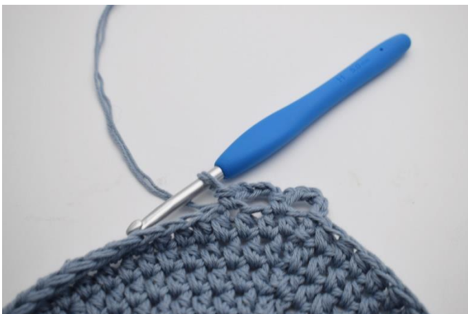
5. skip 1 st, and work 1 sc in the next st.