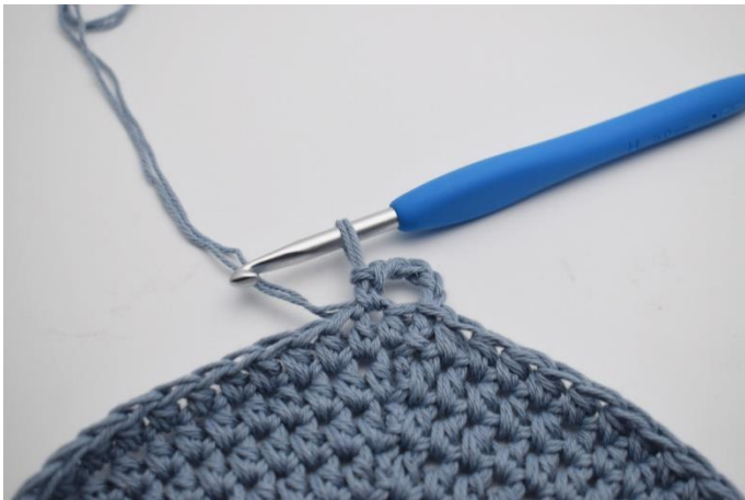
3. skip 1 st, and work 1 sc in the next st.