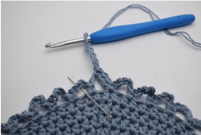
9. In the next ch loop. (Where the needle is pointing)