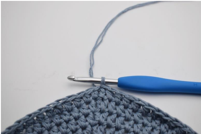
1. This is the end of the base with the final sl st.