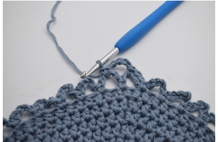
10. Work 1 sc.